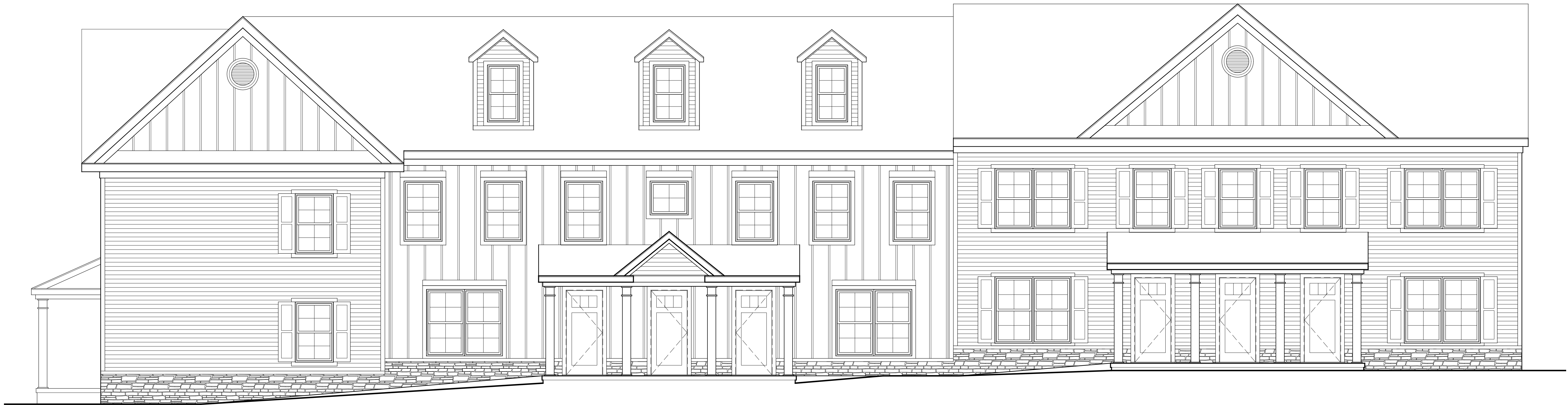
2 WOODLAND AVENUE ELEVATION SCALE: 1/4" = 1'-0"