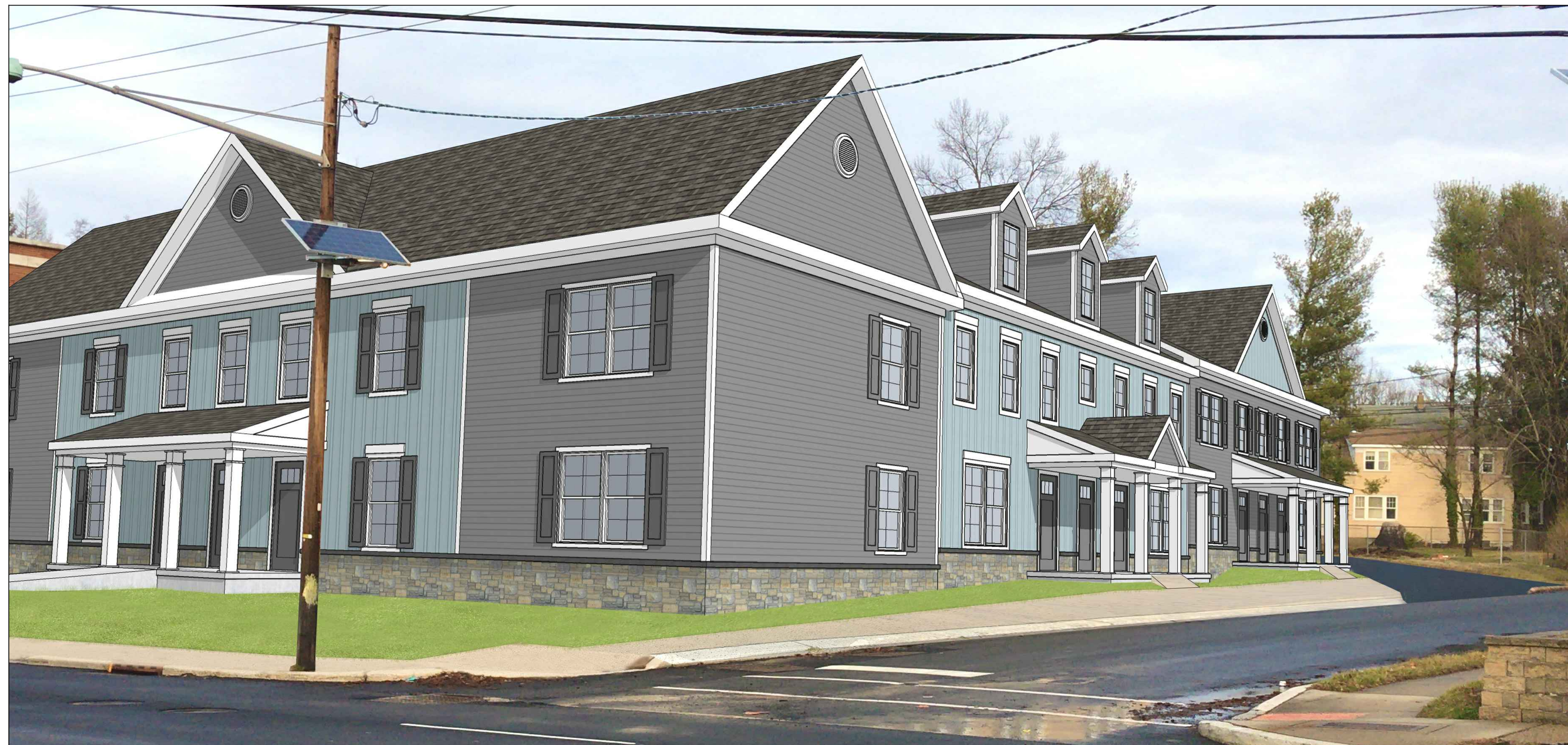
PROPOSED VIEW FROM PENNINGTON ROAD