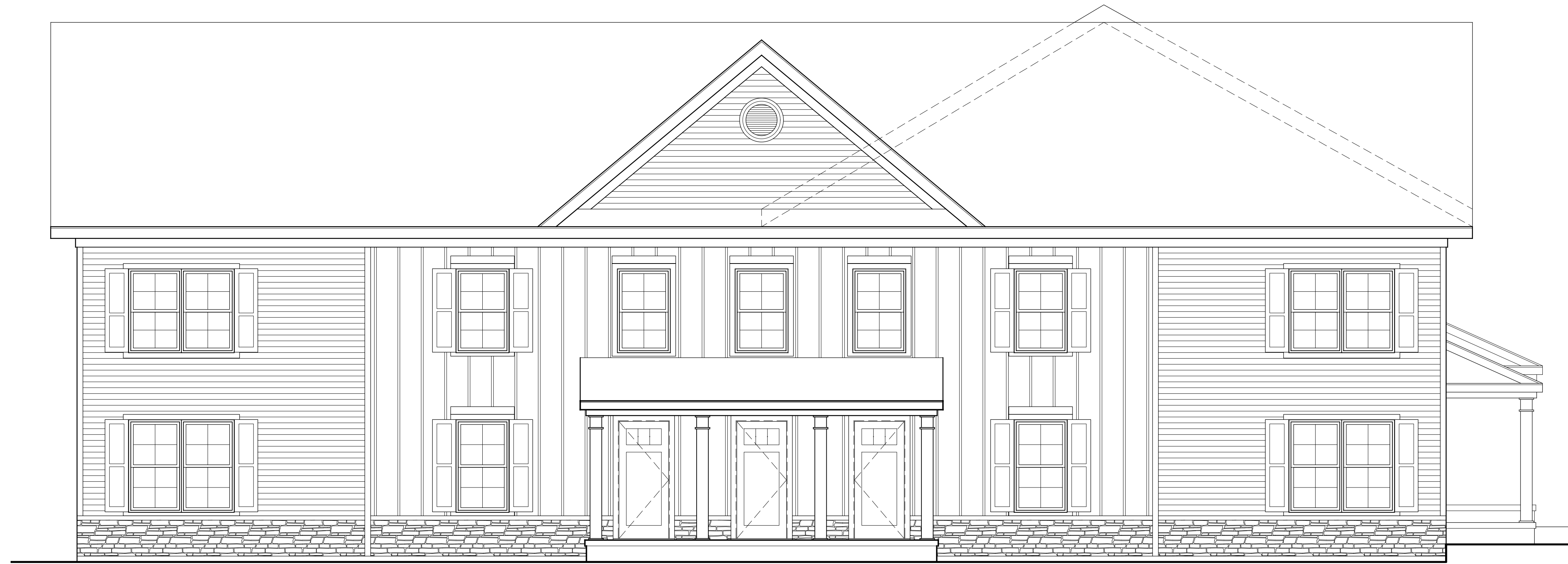
1 PENNINGTON ROAD ELEVATION SCALE: 1/4" = 1'-0"