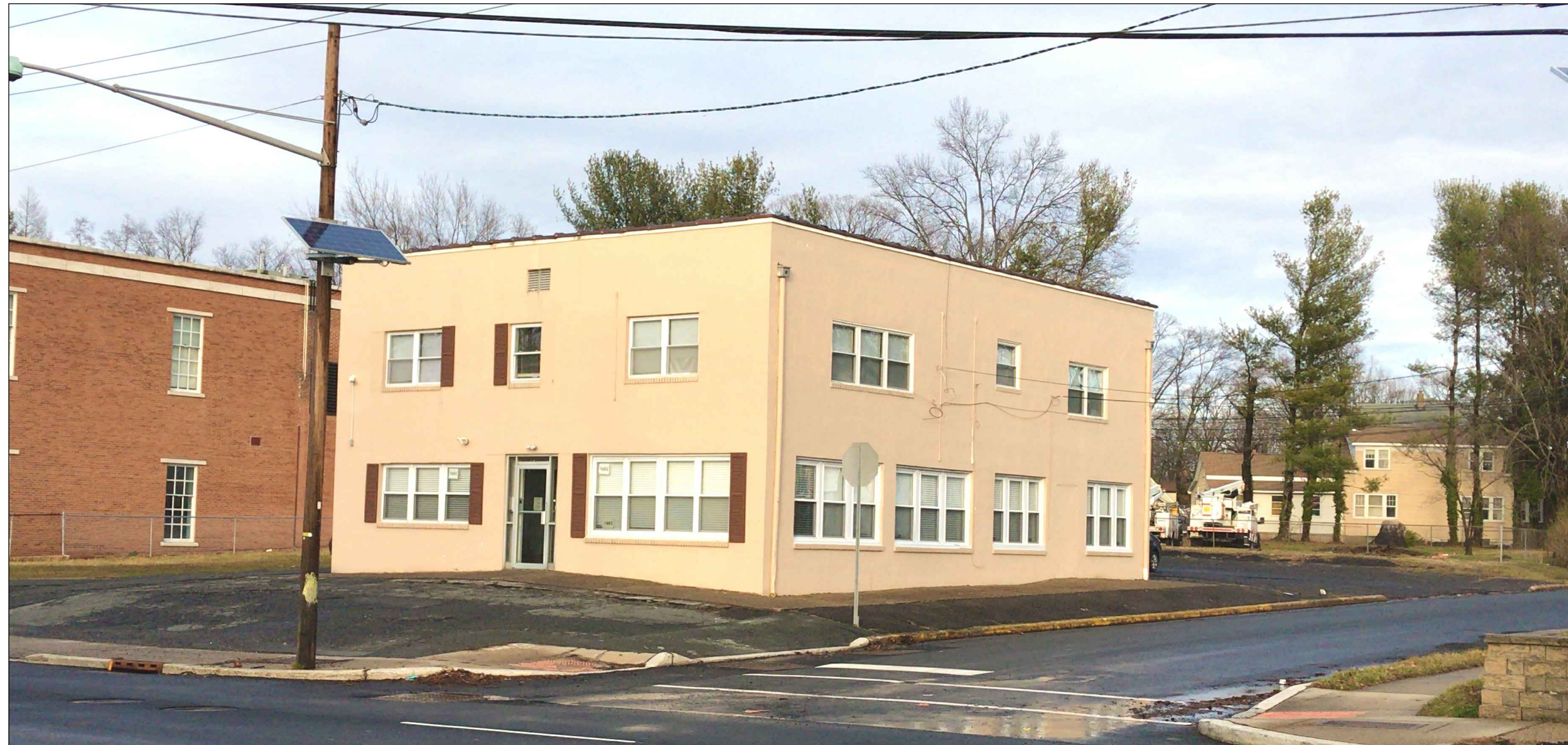
EXISTING VIEW FROM PENNINGTON ROAD